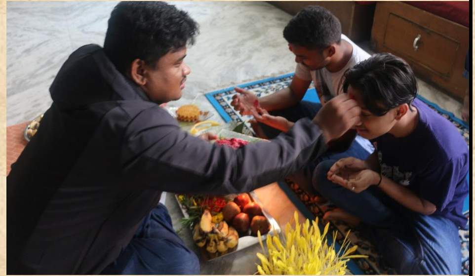
Festival celebration at home