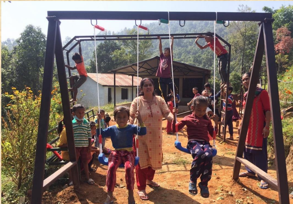
School support – playing equipment's @ Syangja