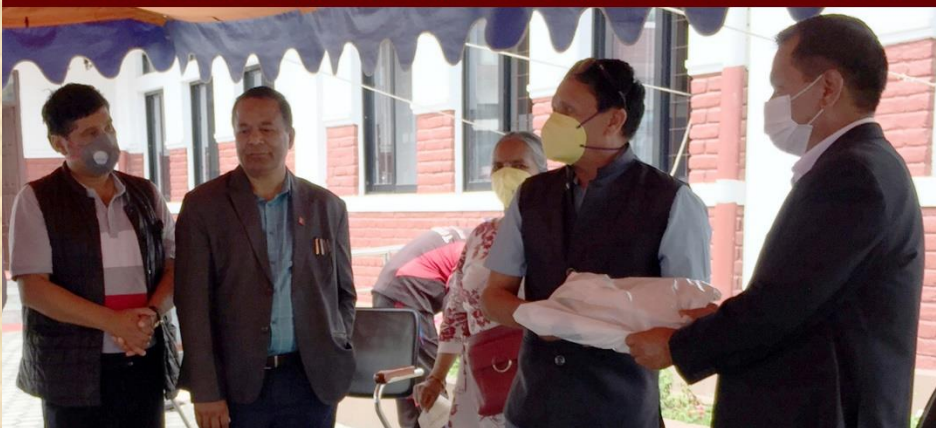
Personal Protective Equipment (PPE) handover to Chief Minister (Gandaki Province)

Namaste Community Foundation Jarewar, Lakeside, Pokhara-6, Nepal Website: http://ncf-nepal.org Email: info@ncf-nepal.org