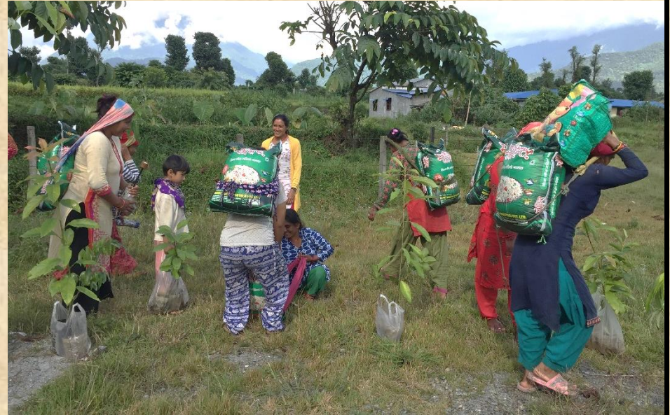
Relief Distribution - Fruit's tree and grocery