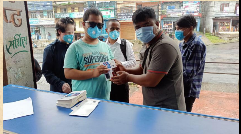
Learning materials to blind students