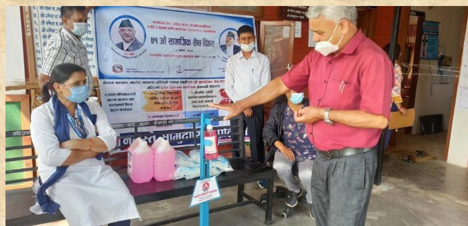
Hand sanitizer donation to Ward office