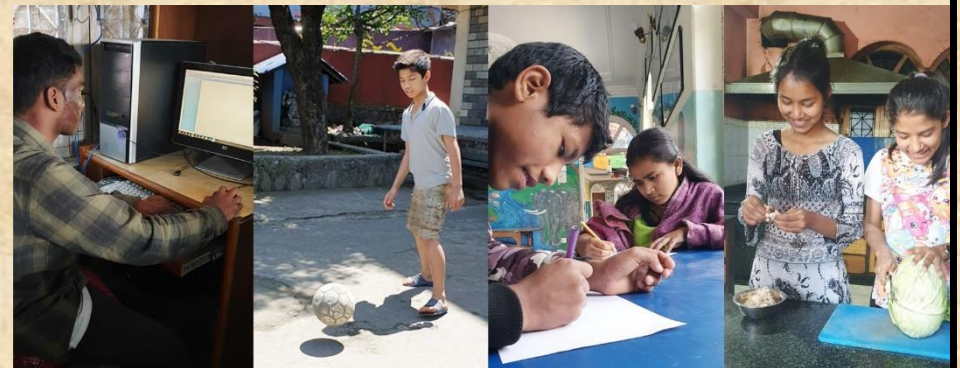
Lockdown activities at children home

Project Administration: Admin. & General Expenses, Human Resource, Transportation, Travel, Consultancy and other General Expenses.