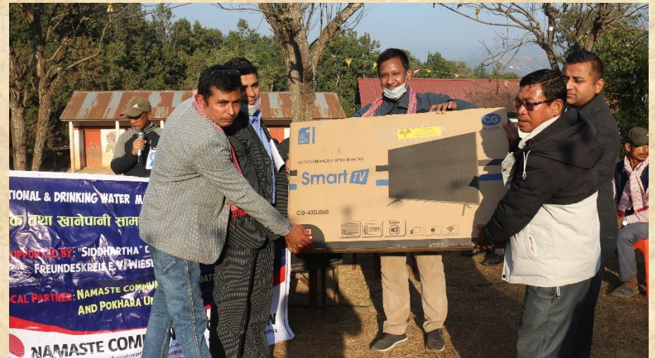
School Support Program – Bhanu-8, Tanhun