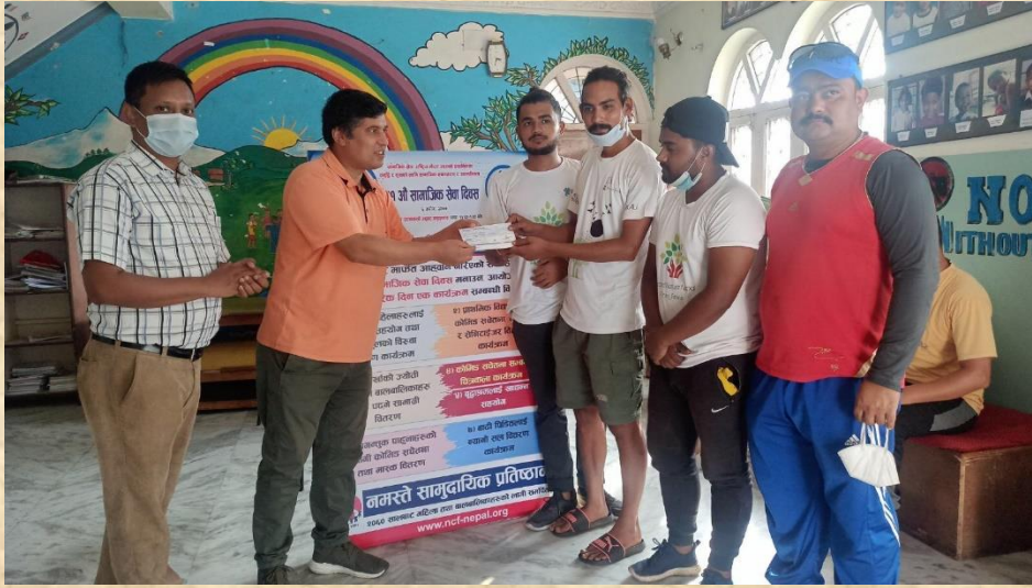
Donation to environmental awareness team