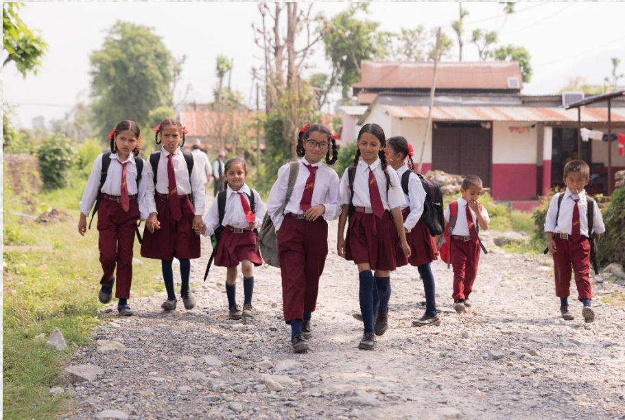
Children getting continuous support according to their class

Examination. At the moment a total of 14 children are getting continuous support from scholarship program. This was the program initiated to support the students those who are not financially sound and has to skip school because of poverty.