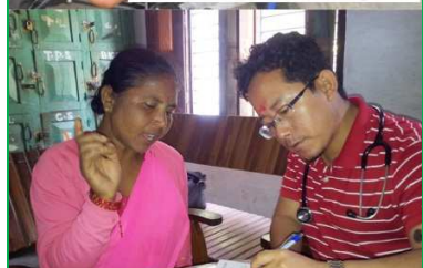
Free Health Checkup camp