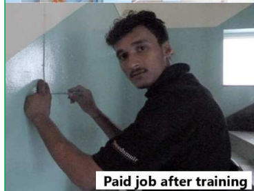
Paid job after training