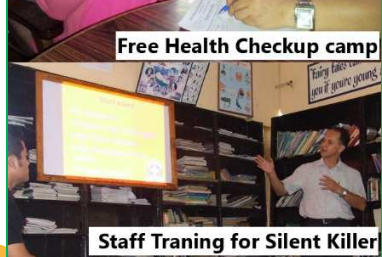
Staff Traning for Silent Killer