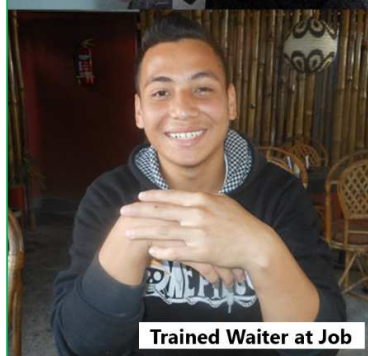
Trained Waiter at Job