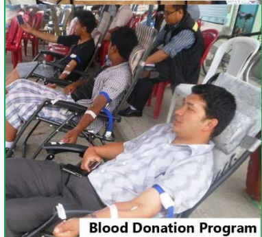
Blood Donation Program