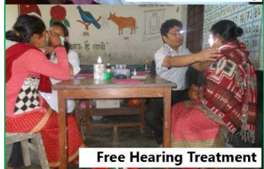
Free Hearing Treatment